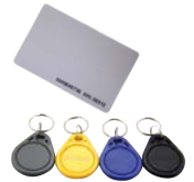
RFID Cards & Tags